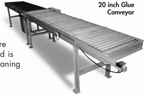
20 inch Glue Conveyor

The Doucet Glue Conveyor features a mild angle iron infeed conveyor, a stainless steel glue roller and a stainless steel angle iron outfeed conveyor.