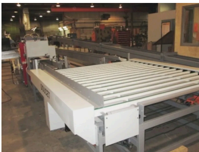
EZYPAC 400 - VIEW 2