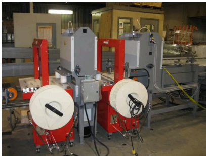
EZYPAC 400 - VIEW 1