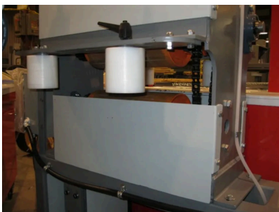
EZYPAC 400 -TOP MOTORIZED ROLLS