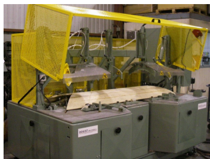
CFS - DOUBLE FISHTAIL SAW