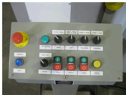
CFS - CONTROL PANEL