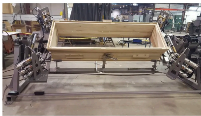
CBP - CASKET BOX PRESS VIEW 2