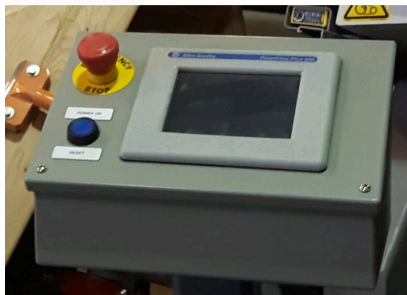
CCP - HMI CONTROL PANEL