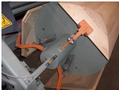
CCP - PNEUMATIC CLAMP