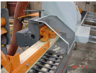
END-PRESS - PRESSURE PAD