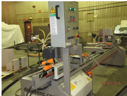
J60 - HYDRAULIC DOUBLE-END BORING/CHUCKING