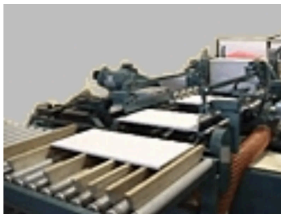
J60 PERCEUSE HYDRAULIQUE HORIZONTALE À DEUX TÊTES : TRANSFERT AUTOMATIQUE