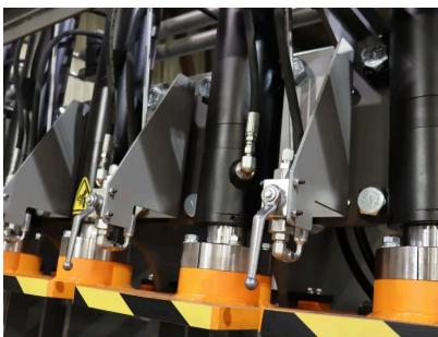
3" HYDRAULIC CYLINDERS WITH INDIVIDUAL VALVE