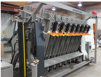
ROTATING 4 SECTION HYDRAULIC STILES PRESS