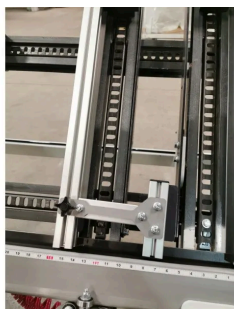
SMALL PART INSERT PHOTO 1