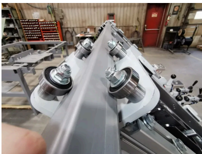
MOVABLE CLAMPS ON BEARINGS