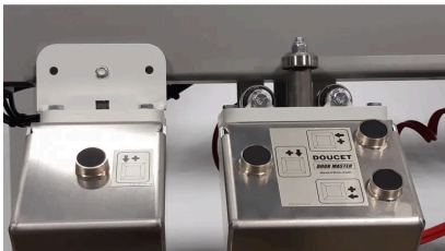
MITER PUSH BUTTON ADJUSTMENT