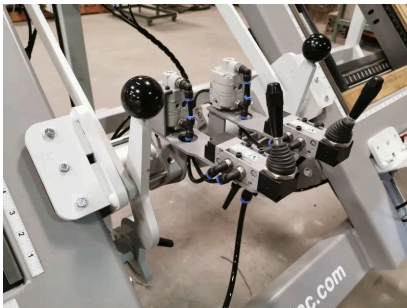
TRIPLE P SYSTEM