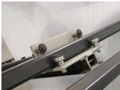
MOVABLE CLAMPS ON BEARINGS