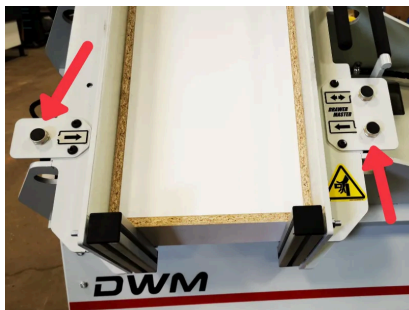
SAFE TWO-PUSH BUTTON OPERATION