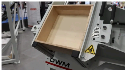
STANDARD FINGER TYPE DOVETAILS