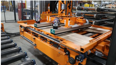
ROW SPACING SYSTEM