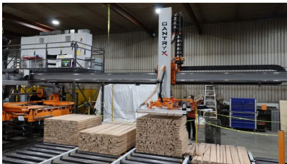
GANTRYX IN ACTION