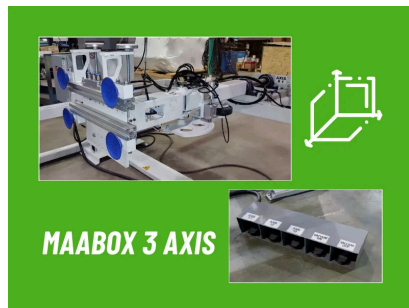
MAABOX 3 AXIS

MAABOX - The multi-axis arm for enclosure box allows to rotate parts on every side easily and quickly.