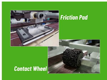
CONTACT WHEEL AND FRICTION PAD