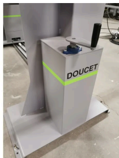
TABLE HEIGHT ADJUSTMENT CRANK