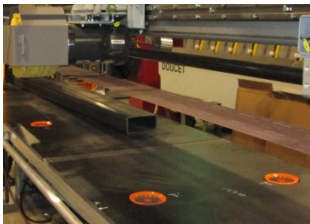
Table with Vacuum Cups

To view video of this product, scan this QR Code with your mobile phone