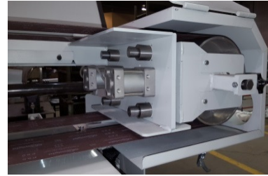
Pneumatic Belt Tensioner